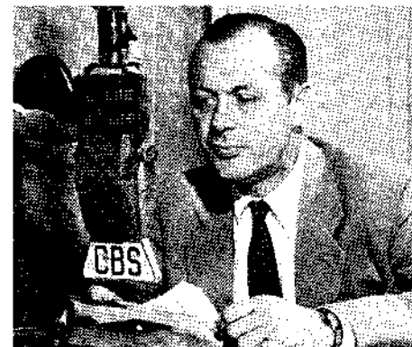
Robert Montgomery on "Suspense"