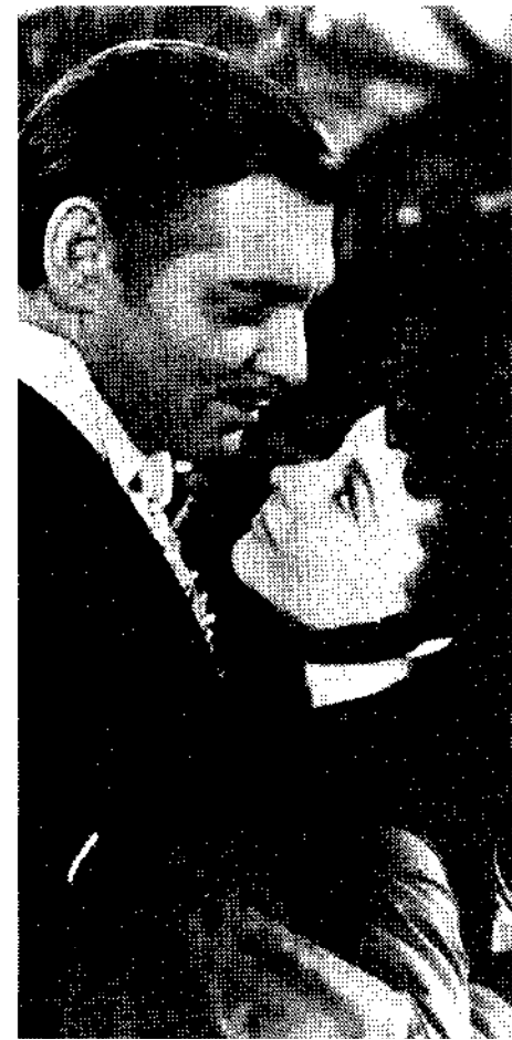
RHETT AND SCARLETT: CLARK GABLE AND VIVIEN LEIGH

The only question left to ask is, do we really need a sequel to "Gone With the Wind"? Should the world know if Scarlett and Rhett get back together or should it remain one of life's great mysteries? Considering the current trend towards soap operas on televi-