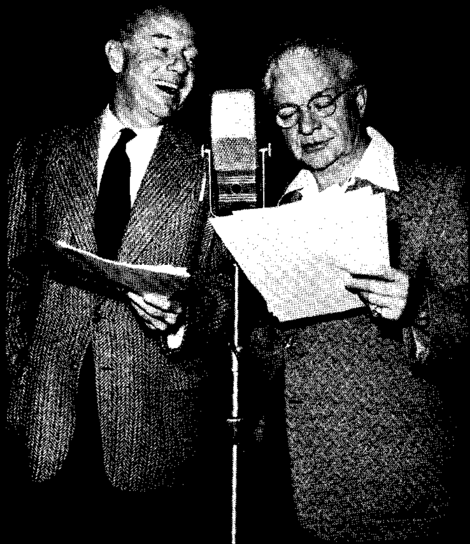
FREEMAN GOSDEN CHARLES CORRELL