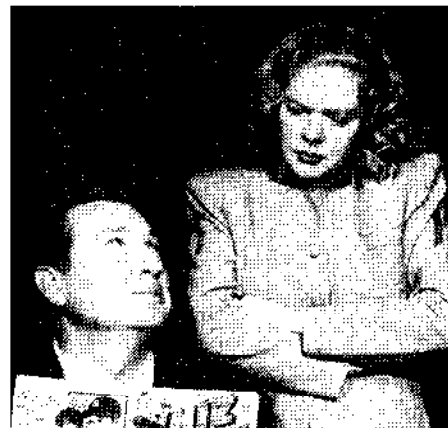
Phil Harris and Alice Faye